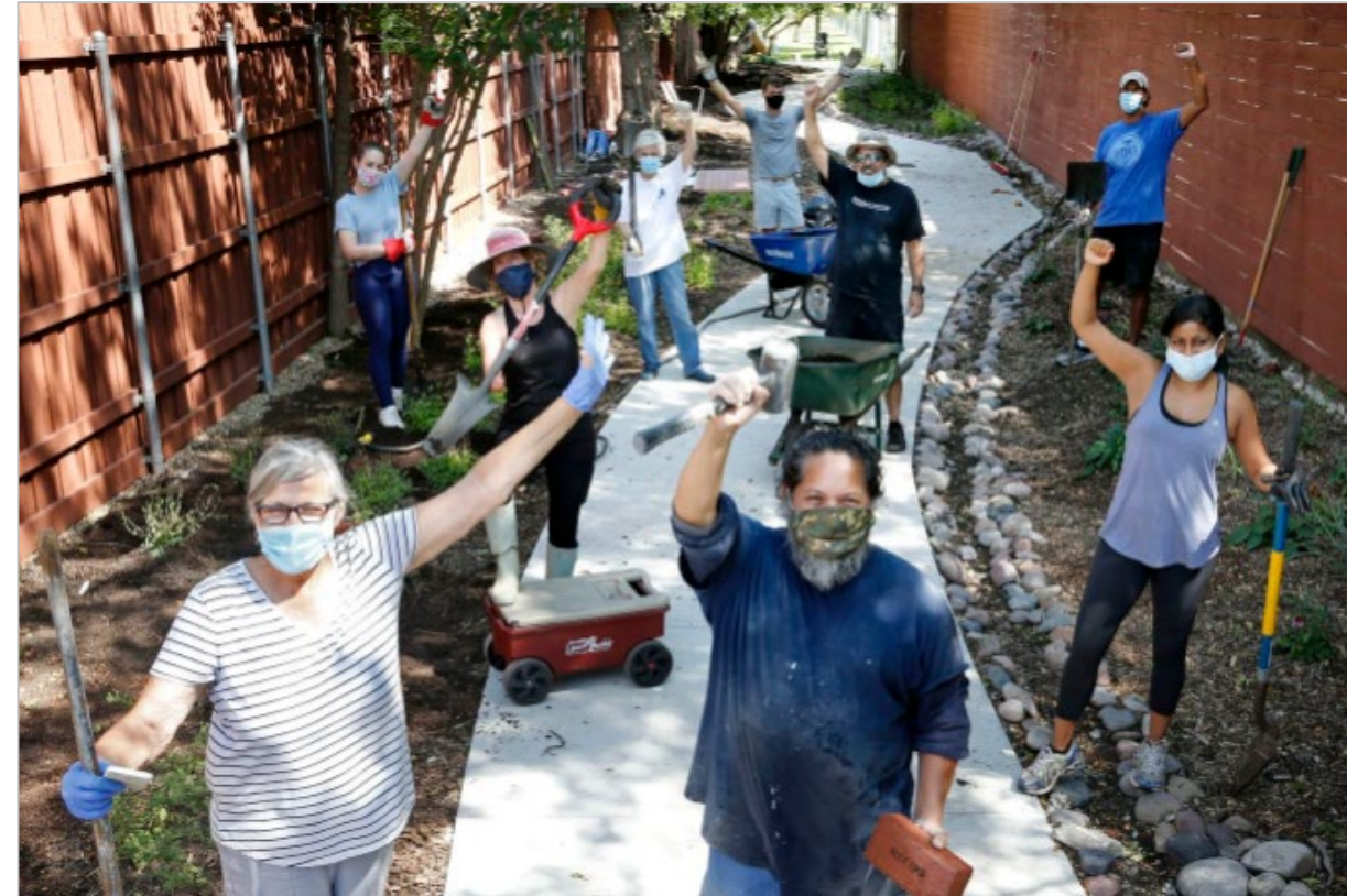
Cochran Heights neighborhood alley sidewalk project