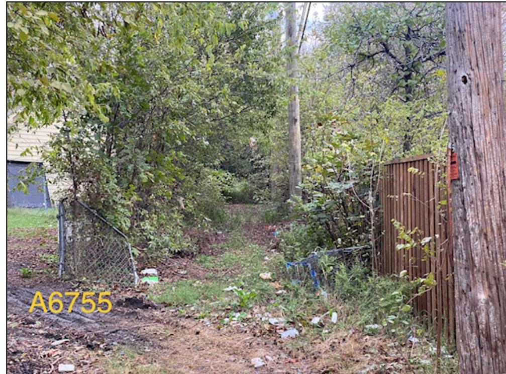
Before and after pictures of alley off Murdoch Dr. (CD8)