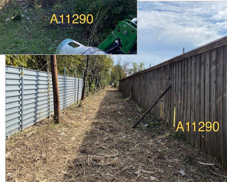
Before and after pictures of alley between Marjorie Ave./Modree Ave. (CD4)